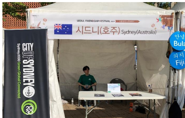
SYDNEY BOOTH "SOLD OUT"

Many people also shared with me their personal connections with Sydney and Australia, which showed the strong people-to-people connections between our two cities.