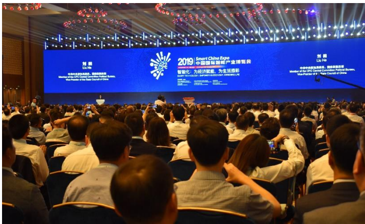
VICE PRESIDENT OF CHINA, MR LIU HE, OPENING THE EVENT

At the 2019 Expo, 530 projects worth over 817 billion yuan ($168 billion AUD) were signed. 843 businesses and 388 representatives attended with a total exhibition area 210,000 square meters.