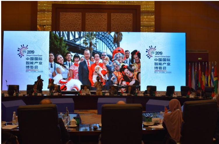
SPEAKING IN THE MAYORS' ROUNDTABLE

The speaking opportunity at the 2 nd Mayors' Roundtable for International Sister Cities of Chongqing aimed not only to promote the City's smart and sustainable development visions and practices, particularly our Digital Strategy, but also to send a welcome to international city and business leaders to collaborate with our local high-tech and innovation businesses, especially startups.