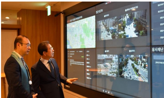
MAYOR PARK EXPLAINING THE E-GOVERNANCE SYSTEM