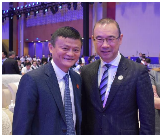
WITH MR JACK MA, THE FOUNDER OF ALIBABA

CEOs and presidents of world leading companies including Apple, UK Telecom, Qualcomm, SAP, Oracle, Ford, and Hyundai also presented at the event.