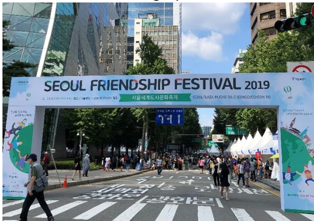
SEOUL FRIENDSHIP FESTIVAL

Seoul Friendship Festival is Seoul Metropolitan Government’s largest multicultural event every year and the 2019 Seoul Friendship Festival featured more than 60 friendship and sister cities of Seoul all over the world, who brought performances, food stalls, handcrafts, tourism news, and city and government information to local communities.