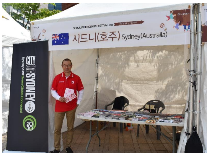
WORKING IN THE SYDNEY BOOTH IN SEOUL FRIENDSHIP FESTIVAL

My attendance to the Seoul Friendship Festival provided a great opportunity to meet with Seoul local residents and to pass on Sydney's warm welcome. I brought 18kg of City of Sydney materials and the City's pull up banner with me and was present in my City of Sydney Volunteers T-shirt to work a Sydney Booth in the Festival. Our booth was the one of the most popular and all the materials were gone within a few hours.