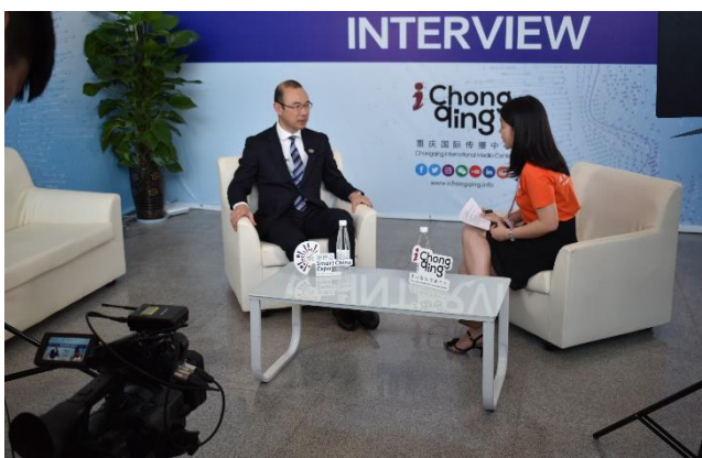
IN MEDIA CALL WITH CHONGQING MEDIA

Chongqing local media requested media calls during my attendance in the Expo.